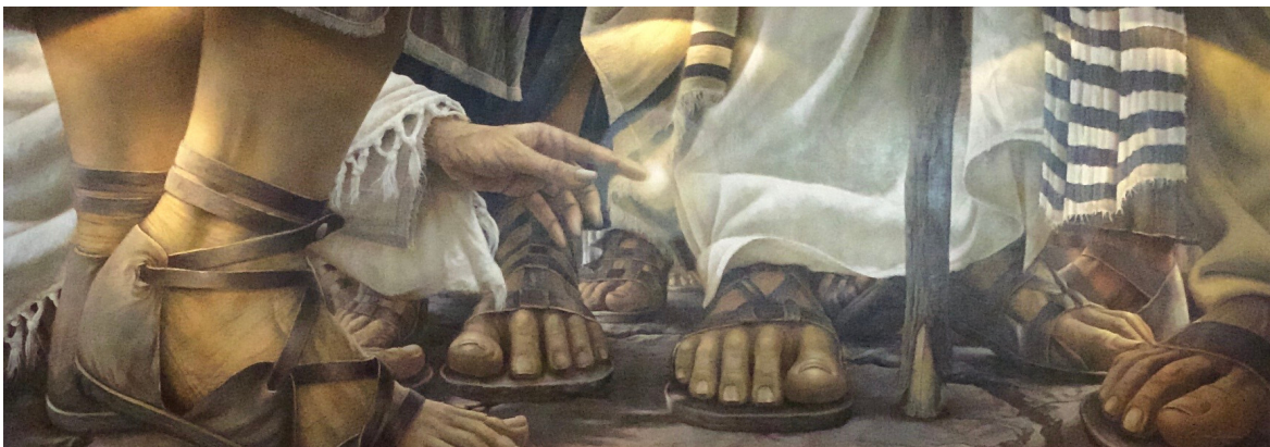
Church of Mary Magdalene in Magdala, Israel

All: Jesus, please rise again in our lives.