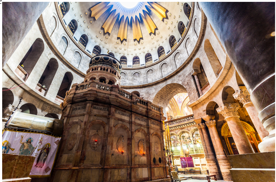
Tomb of Jesus in the Church of the Holy Sepulchre, Jerusalem, Israel

All: Jesus, please rise again in our lives.